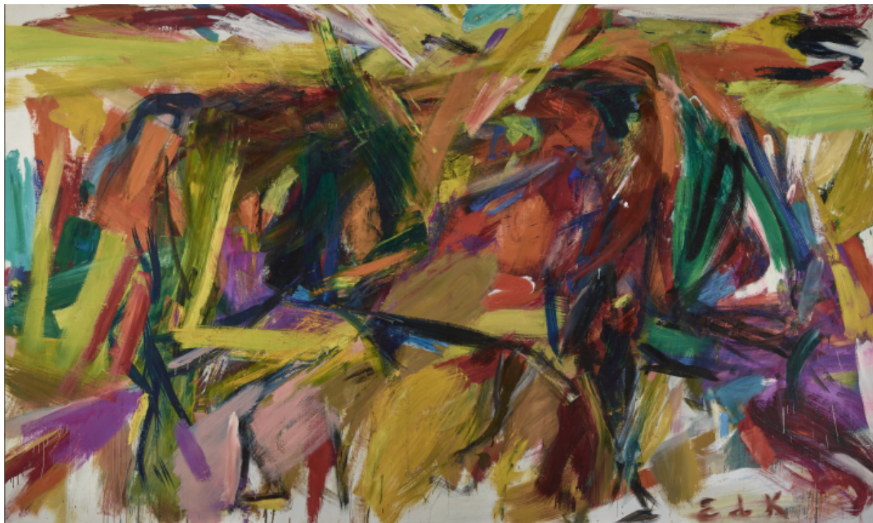
Elaine de Kooning, “Bullfight” (1959), oil on canvas, 77 3/8 in. x 130 1/2 in. (Denver Art Museum Collection: Vance H. Kirkland Acquisition Fund, 2012.300 © Elaine de Kooning Trust Photography courtesy of the Denver Art Museum)

KATONAH, New York — The Ninth Street Show in 1951 is among the more enduring of the origin stories about New York’s postwar art scene, uniting the theme of artist solidarity to the ideal that art can be a vocation unsullied by money and fame.