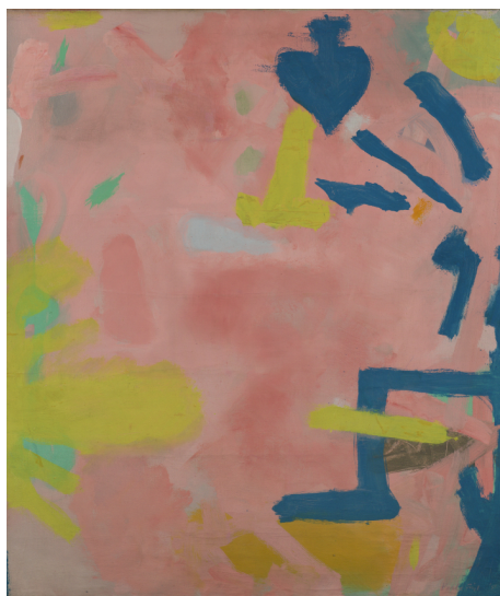
Perle Fine, "Untitled (Prescience)" (1951), oil on canvas, 44 x 37 in. (© AE Artworks, Courtesy Berry Campbell, New York)

In hindsight, maybe a few things did impede. After all, the culture in which these Ninth Street artists created their art effortlessly ignored it, and women's art was considered less valuable than men's. So it was then, so it is now. And today American art remains further imperiled by its absurd, inflated commodification, by the banal ideological agendas of cultural institutions, and of course by a deep-seated general neglect of its real meanings. By taking up painting as a personal obsession and vocation that provide its own inherent incentives and rewards, these artists remind us about the deep pleasures and high cost of independence. And, rather urgently, their lives and works embody the countercultural power that can flow from all serious art.