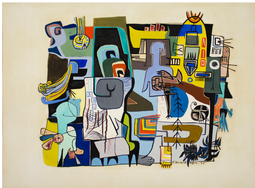
Sonja Sekula Pour l'Animal Noir , 1945 | ink and gouache on paper | 12 x 16 1/2 in. (30.5 x 41.9 cm) | Courtesy Peter Blum Gallery, NY

The 9 th Street Show was assembled by artists of what came to be known as the “New York School” who were frustrated by the lack of attention and respect they received from the city’s art scene. Curated by the now renowned gallerist Leo Castelli and located in an abandoned East Village storefront, the show featured works by 70 artists, almost all of them men, some of whom would go on to achieve legendary status, such as Willem de Kooning, Jackson Pollock, and Franz Kline.