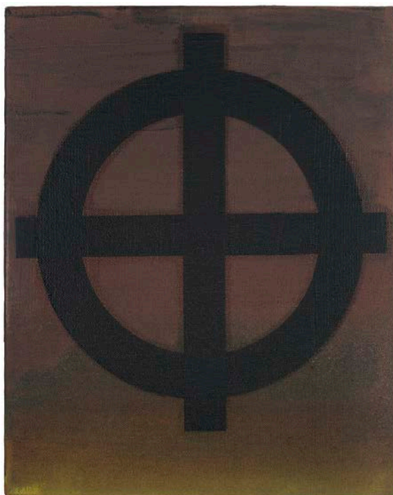
Sektion des Zorns , 2013 Vegetable oil, acrylic on canvas 19 5/8 x 15 3/4 inches (50 x 40 inches)

"Sektion des Zorns" (2013), the other work at Peter Blum not from the title series, is hung high at the center of the room. It shares some formal and material features with the Ferner paintings flanking it. Its dimensions are identical and its image is also a circle, albeit one overlaid with a cross, the arms of which are a little shorter than it is tall. The work is painted with vegetable oil and acrylic paint—smoggy glazes of rusty brown glowing acid yellow at the bottom, the sigil overlaid in a strong, hard black. The ancient-looking cross is heavy and matte, and sits on top of the muted field, sinking backward in visual space and pulling the viewer with it. In its high, central placement, "Sektion" leans slightly off the wall so that it towers over viewers and expands outward into the space, dominating and reigning over the others as an icon, lord, or father. The title translates as the religiously, omnipotently imbued phrase "section of wrath."