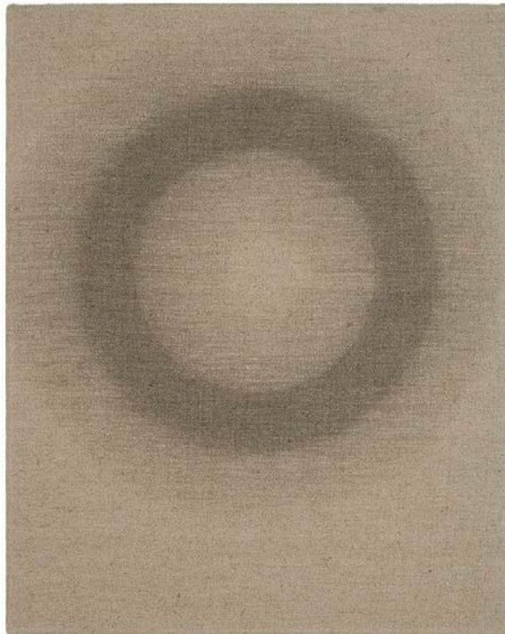
Ferner J (Der Knochen) , 2013. Vegetable oil on canvas, 19 5/8 x 15 3/4 inches (50 x 40 cm)

Helmut Federle's fifth solo exhibition at Peter Blum, The Ferner Paintings , is promoted with an announcement card that excerpts an anecdote from Giorgio Vasari's The Lives of the Artists (1550), wherein Italy's great painters were asked by the Pope to prove their skill. Vasari reports that Giotto was judged as the greatest of all the candidates by replying with a perfect freehand drawing of a circle on an otherwise-blank sheet of paper. Federle reproduces this feat with extremely spare means. The 17 works in the Ferner Series, each designated with a letter from A to Q, were made between 2012 and 2013. Seven are shown here, along with two other paintings that are not part of the series but are formally parallel.