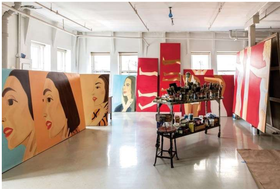
Katz's New York studio, on West Broadway, where his recent work includes a series he calls "Coca-Cola Girls" (on the right), inspired by advertising signs from the fifties.

When he switched to black, for the lower half of the painting, he didn't need the platform. The black was lustrous, somewhere between glossy and matte. He worked upward from the bottom until the only strip of bare canvas was a narrow, uneven gap between the two colors. Still using a big brush, but painting more slowly, he began to fill in that space. Barely discernible shapes and outlines emerged in a few places: tree branches against the night sky. There was a sense of movement and distance. Katz was painting wet into wet, and not making mistakes.