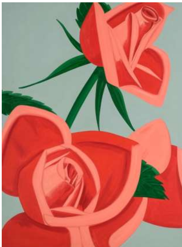
"Rose Bud," from 1967.

Katz's real mentor in those days was Edwin Denby, the poet and dance critic. "Edwin was like my graduate school," Katz said. "Through Edwin, I got involved with modern dance." Denby and the filmmaker Rudy Burckhardt are immortalized in one of the cutout-metal sculptural portraits that Katz started doing in the late fifties; they sit on folding chairs in his West Broadway loft, facing one another, deep in a discussion, so convincing that for a moment I thought they were real. Denby introduced Katz to the choreographer Paul Taylor, and for three decades Katz designed sets and costumes for Taylor's dance company. They had a falling-out at one point, over a Katz set design that Taylor disliked, but they eventually reconciled, and collaborated on one more dance. Fallings-out are not uncommon with Katz. He says exactly what he thinks, on every occasion, and his opinions can be abrasive.