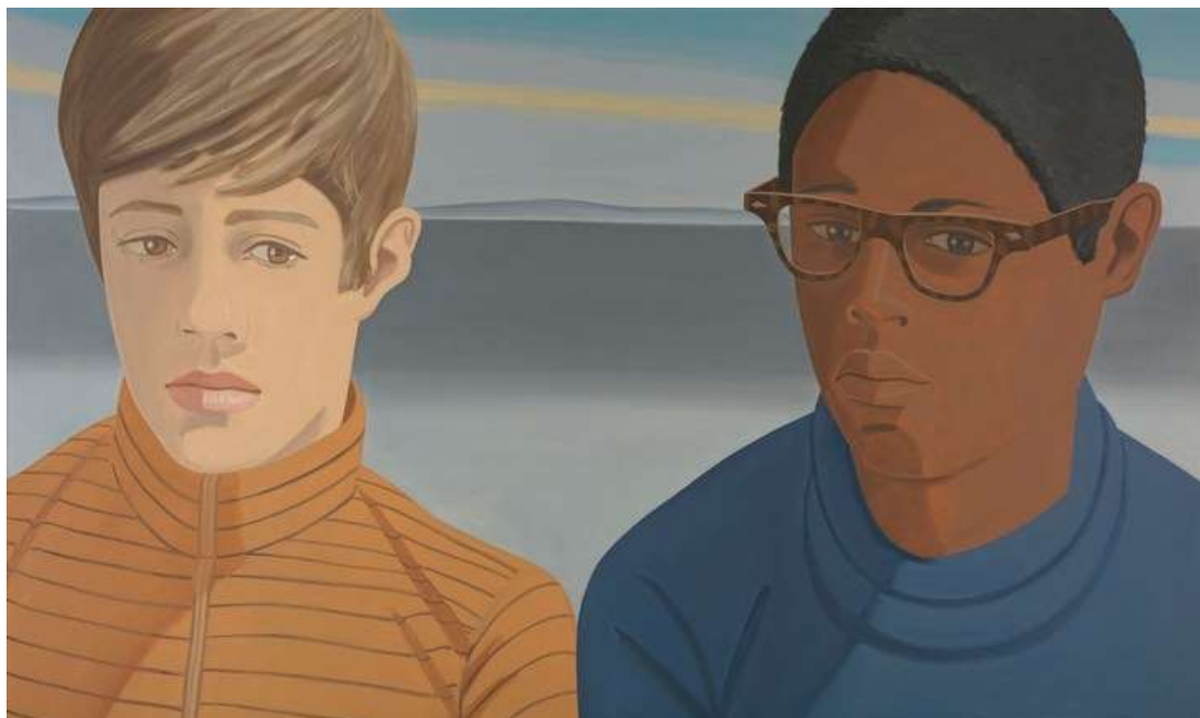
“Vincent and Tony,” from 1969. Courtesy the Art Institute of Chicago

that are two coats of rabbit-skin glue on the canvas,” he said. “The light goes into it, and comes back out.”