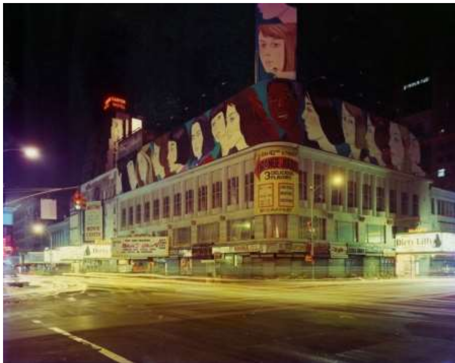
“Times Square Mural,” from 1977.