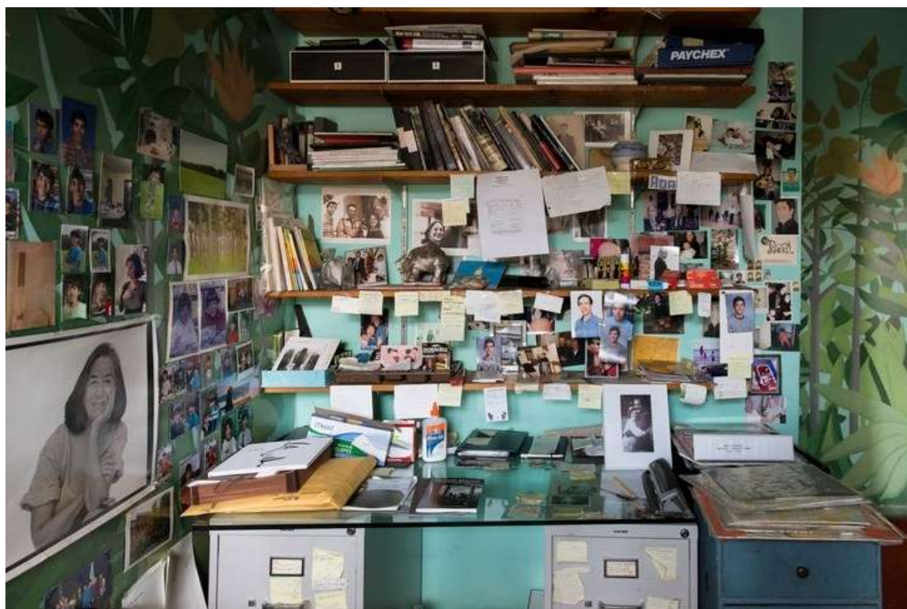
An office in Alex Katz's studio, filled with photos of his family.