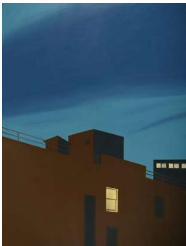
“SoHo Morning,” from 1987.