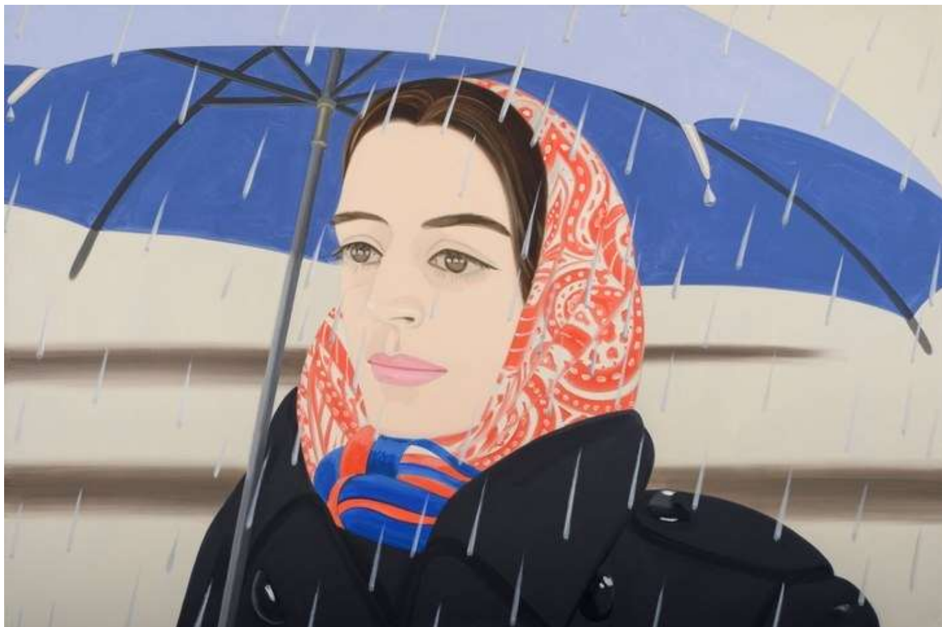
“Blue Umbrella 2,” from 1972.

Horn State Park,” a fully antlered bull moose turns to look at us over its right shoulder—“Just like Betty Grable,” Katz suggests.