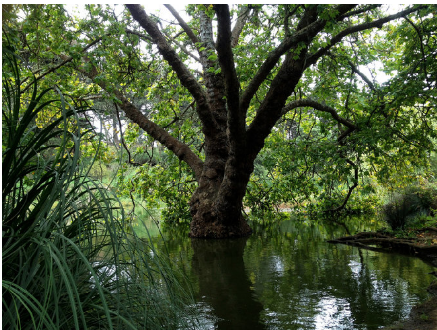
Mr. Dorsky's "Avraham" (2014). Credit Nathaniel Dorsky/Peter Blum Gallery, NY

Every so often while watching the work of Nathaniel Dorsky, I let out a yelp of joy. Mr. Dorsky makes blissfully beautiful films that don't tell stories but instead explore the world, the medium and our relationship with each. They're short, averaging around 20 minutes, and visually dense, with layers of pulsing color, churning film grain, shifting light and mutating form. Their actors, as it were, are the objects, the flowers, trees, animals, people and cars that slip in and out of the frame, although it is film – fragile, alchemical, magical, lush and luminous – that is the star. Like the gold and silver used in illuminated manuscripts, film creates a radiant glow that suggests why Mr. Dorsky calls his art devotional cinema.