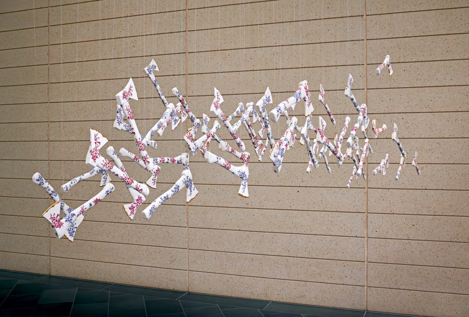
Installation view of Art for a New Understanding: Native Voices, 1950s to Now , Nasher Museum, Duke University, NC, 2019-20

"The capability of the hatchets is not in their ability to split wood or bone, but in their ability to shatter."