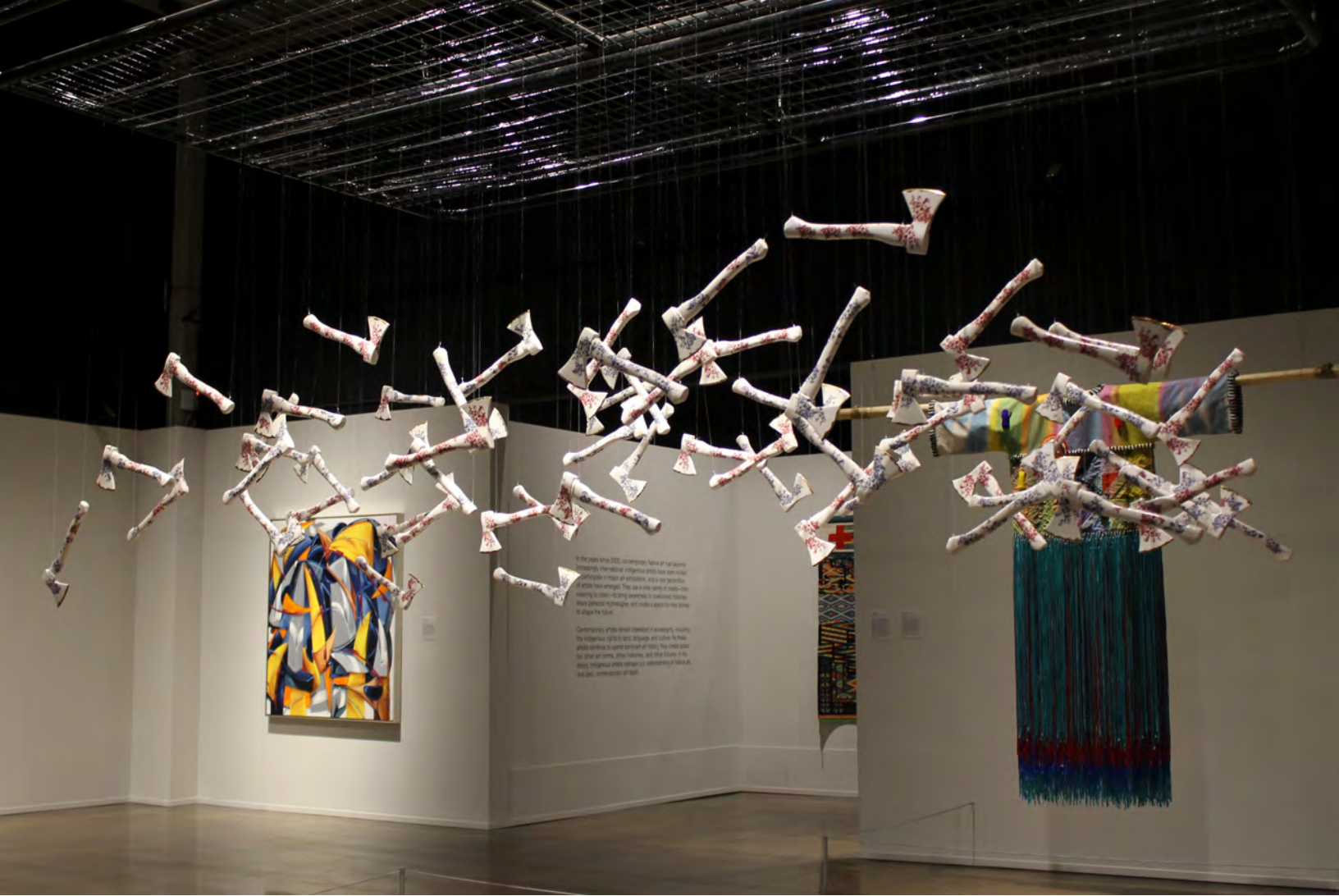
Installation view of Art for a New Understanding: Native Voices, 1950s to Now , Memphis Brooks Museum of Art, TN, 2020

60 white porcelain hatchets, patterned with red and blue florals, tumble end over end in a shallow arc. Suspended from the ceiling by threads of clear fishing line, they fly as if thrown. Rising from chest height, the visitor can just barely walk under the peak of their crest before the axes fall and come to a stop at eye level. Their shadows dance on the walls as the hatchets sway on their strings, the angular shades appearing out the corner of one's eye like another crowd of blades thrown from out of sight. Walking around the installation, one cannot help but step directly into the arrested trajectory and look head-long into the drove of spinning earthenware. Staring down the gilded edges, the light shines off their delftware glaze, a glimmering hint at their true fragility.