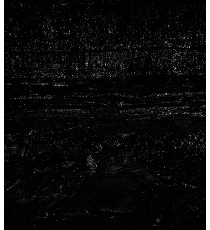
"Coal Seam, Bergwerk Prosper-Haniel #5" by Miles Coolidge, 2013. Pigment inkjet print, 57 x 50 inches. Edition of 5. Courtesy of Peter Blum Gallery.

The "highlight" of each of the five large-scale images, which measure 57 by 50 inches, is the jagged crack that runs like a scar across the three works on one wall and cuts across the other two that are side-by-side on the next wall. Like the set for a production of Richard Wagner's Ring cycle, these images convey the epochal duration of geological time, millions of years of compression. They also capture the somber blackness of the ancient ore that is responsible for a choking smog in Beijing, which even the local officials (known for their bald-faced lies on climate change) are calling a "meteorological disaster."