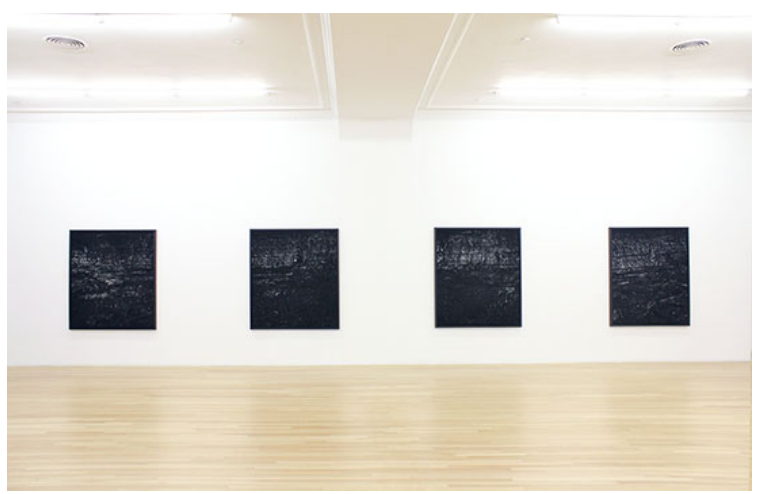
"Coal Seam Redux" by Miles Coolidge, on view at Peter Blum Gallery.

The "highlight" of each of the five large-scale images, which measure 57 by 50 inches, is the jagged crack that runs like a scar across the three works on one wall and cuts across the other two that are side-by-side on the next wall. Like the set for a production of Richard Wagner's Ring cycle, these images convey the epochal duration of geological time, millions of years of compression. They also capture the somber blackness of the ancient ore that is responsible for a choking smog in Beijing, which even the local officials (known for their bald-faced lies on climate change) are calling a "meteorological disaster."